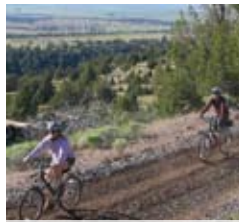
Modoc Line, Modoc County