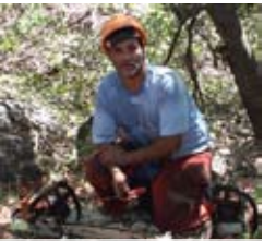
Fuels Reduction, Calaveras County