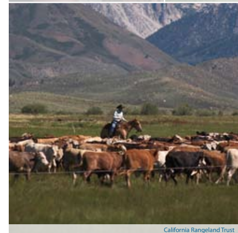
California Rangeland Trust