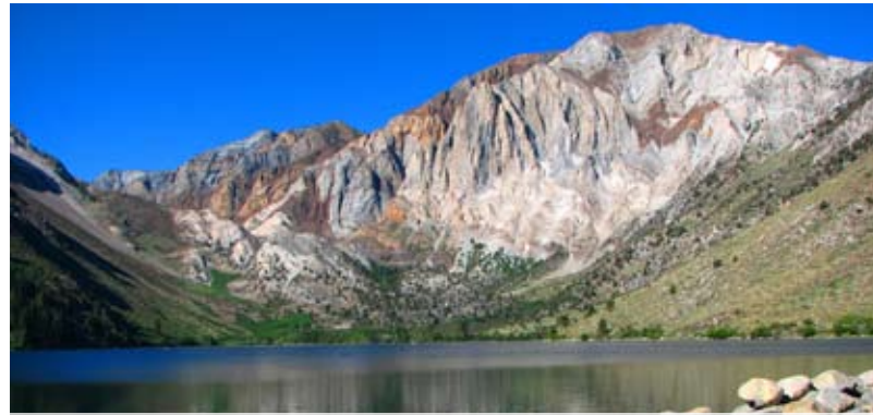
Convict Lake, Mono County

The Sierra Nevada Conservancy initiates, encourages, and supports efforts that improve the environmental, economic and social well-being of the Sierra Nevada Region, its communities and the citizens of California.