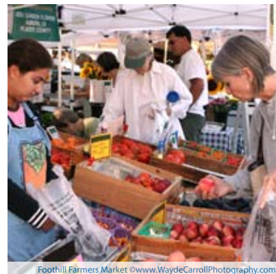
Foothill Farmers Market