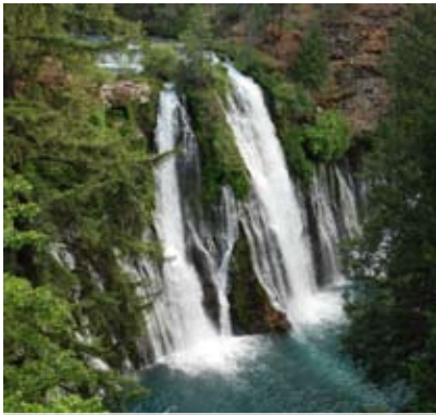
McArthur-Burney Falls Memorial State Park