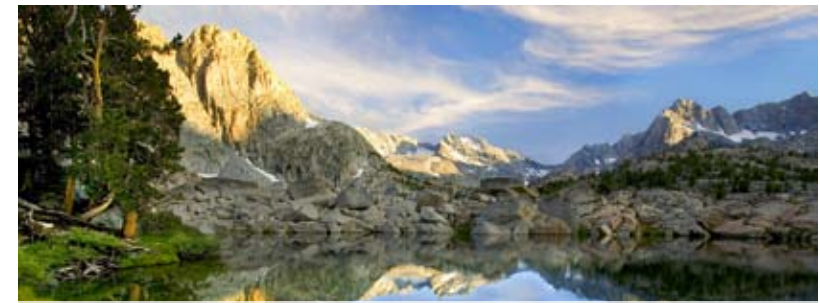
Pee Wee Lake, High Sierra