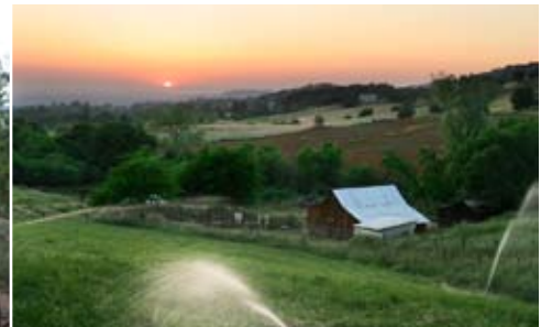
Barn in Placer County