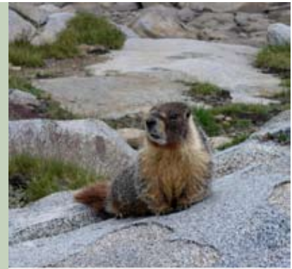
Marmot, Ansel Adams Wilderness

The magnificent Sierra Nevada Region enjoys outstanding environmental, economic and social health with vibrant communities and landscapes sustained for future generations.