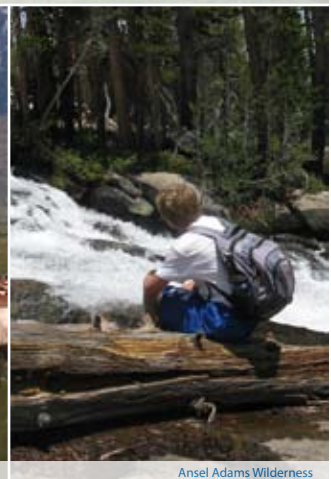
Ansel Adams Wilderness