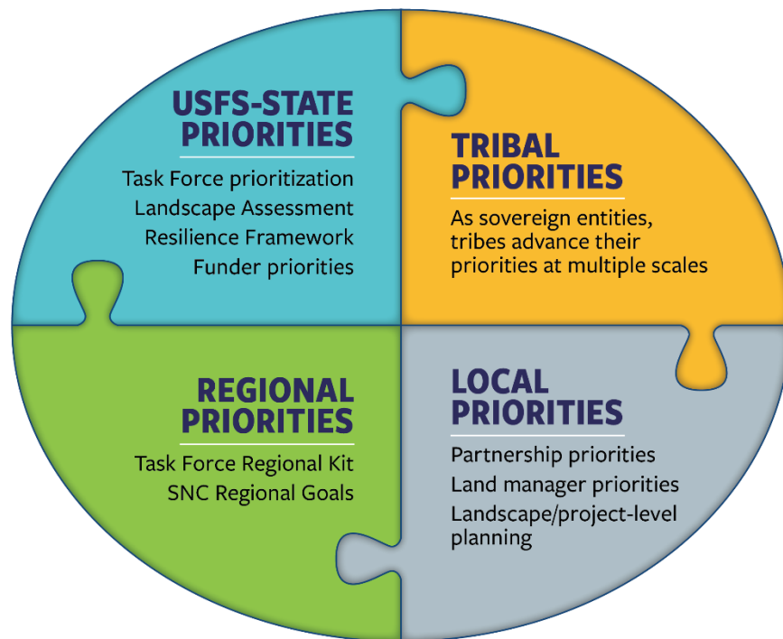
Figure 2. The SNC and Task Force partners will tailor the Landscape Grant Pilot Program to align priorities across partners. The Task Force Regional Kit, Landscape Assessment, Resilience Framework, and funder priorities are in the process of being developed.

Pending direction from SNC's Governing Board, SNC will enter into agreements with funding agencies to implement the LGPP. The SNC is actively seeking funding contributions from federal and state agencies.